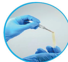
Elasticity & Elongation